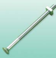
Gutter Bolt & Nut