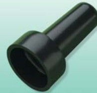
Dowty Top Hats