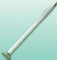
Pakfix Drill Screws