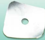
Curved Washers Zinc Plated