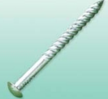
Roofing Drive Screw