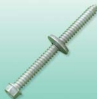
Hexagon Head Self Tapping