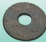
Flat Round Washers Bitumen