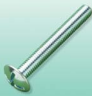
Mushroom Head Roofing Bolts