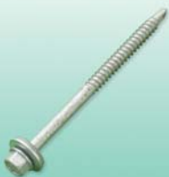
Hexagon Head Drill Screw SD3