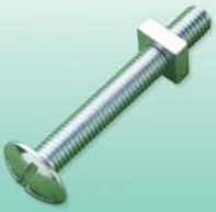
Roofing Bolts & Square Nuts