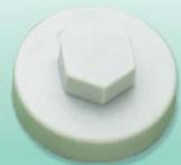
Plastic Hexagon Colour Caps