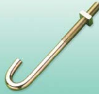
Hook Bolts & Nuts