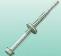
Hexagon Head Drill Screw SD12