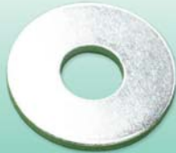
Flat Round Washers Zinc Plated